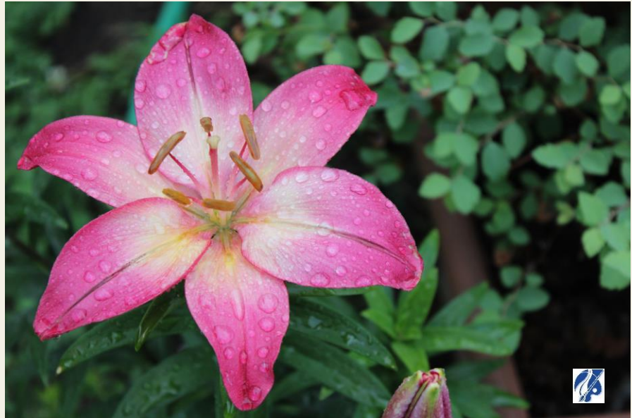
Lilium bulbiferum L