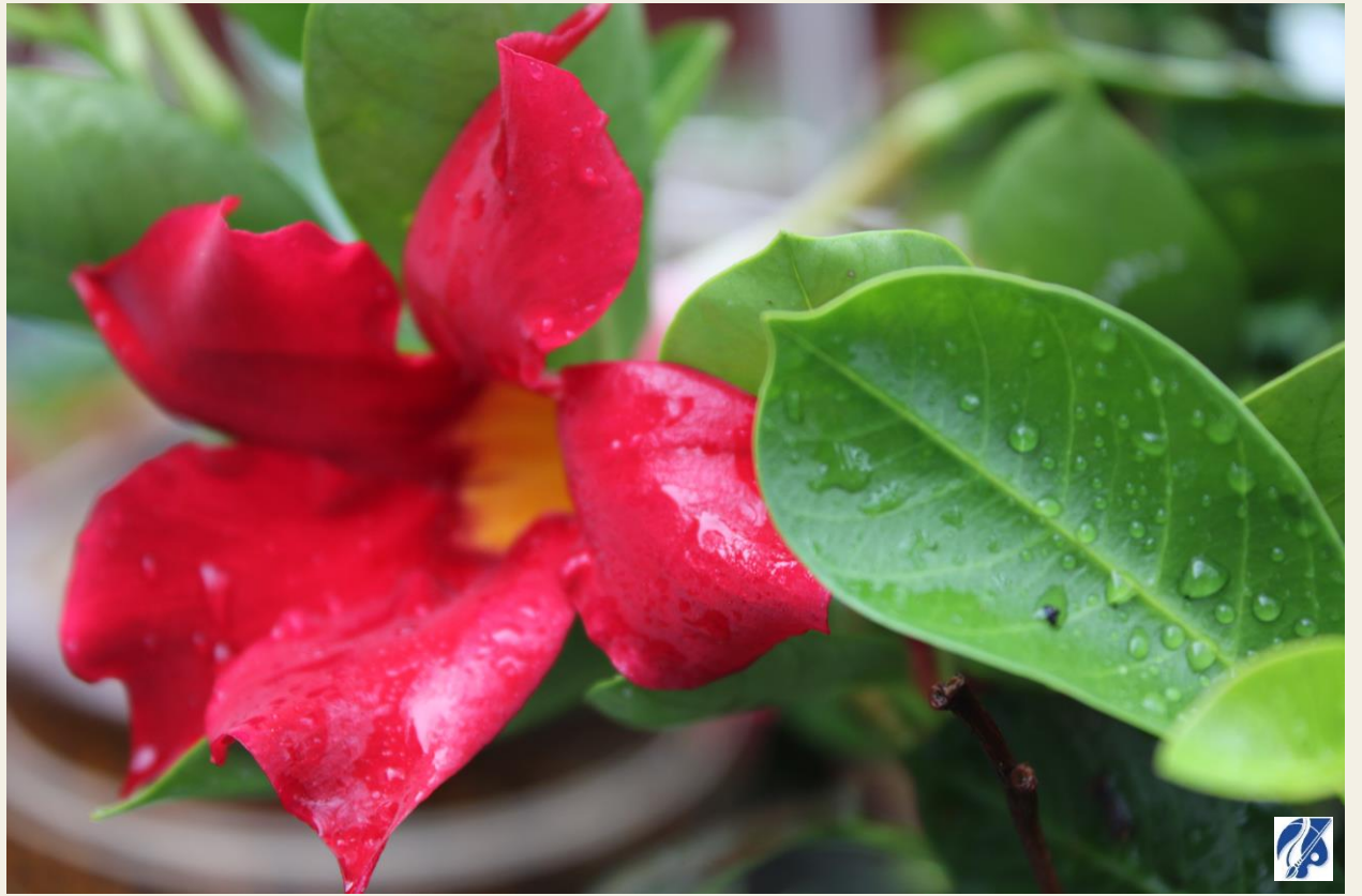
MANDEVILLA SANDERI Dennis Plant Garden IMG-0254