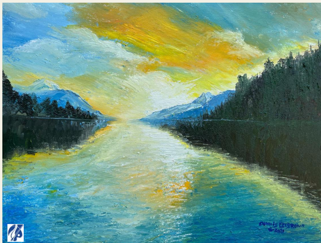
OPRN AIR 16 X 20 Oil on Canvas © Dennis Lee Brown 8-2020 Dennis Fine Art (AAR) IMG-E1138-595USD

Of course, each build layer alters the prior layer, so paintings can very quickly become darkened if constant observation of the lightness of the painting goes unnoticed. Furthermore, layers of glaze can blur the appearance of detail, and manufacturing of details done after glazing, or glazing should happen with caution to enhance them. To practice this technique, make sure you choose a good see-through (transparent) color. Then you will need to mix a small amount of the transparent hue with a medium, usually an oil paint thinner, paint mixed until you reach a transparent fluid