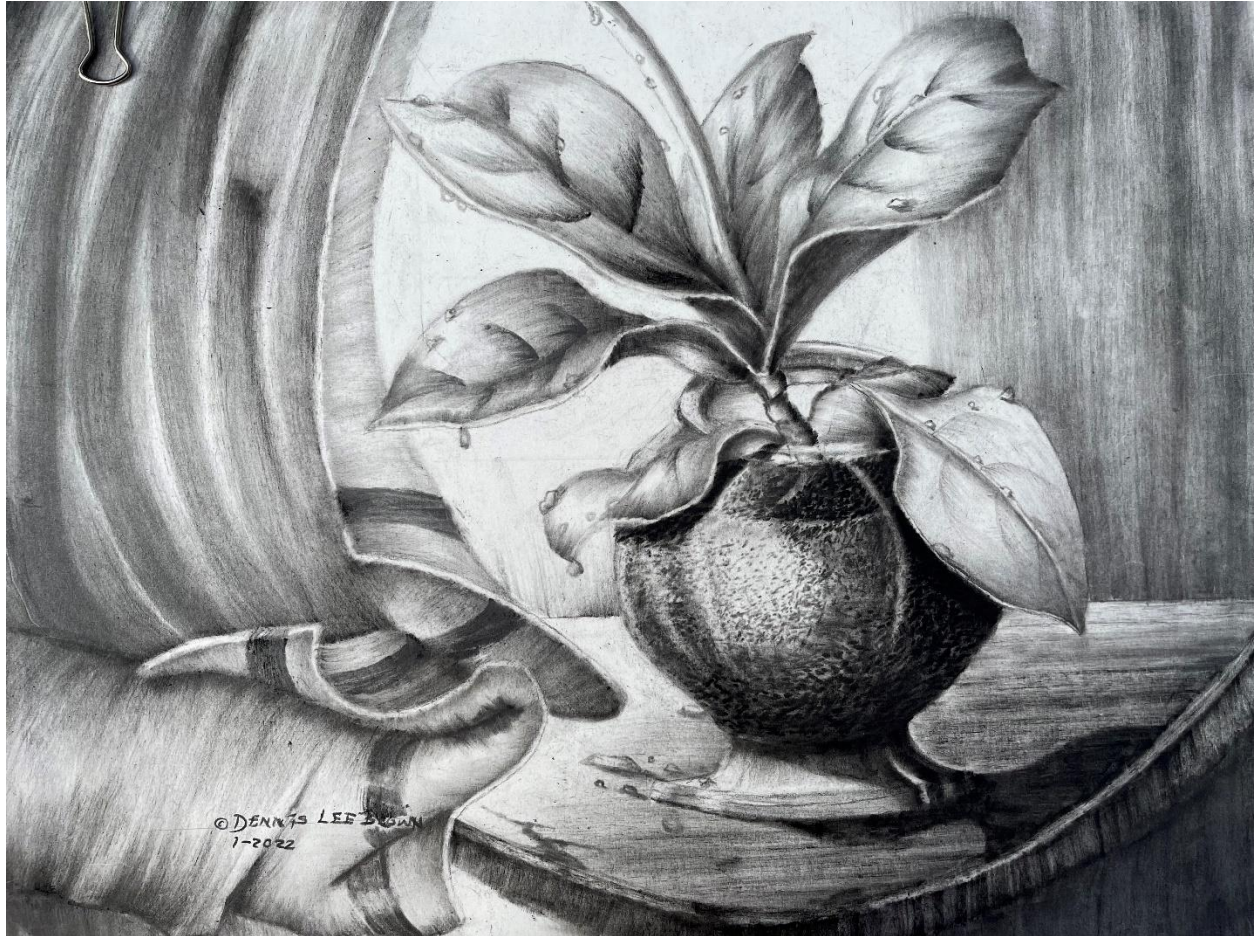
4: AN OVER GROWN POT 17" w X 14" h Stilllife Charcoal & Graphite on Paper © Dennis Lee Brown 11/2022 Dennis Fine Art (ARR Collection: Winter 2022 Drawings IMG-3516-495USD

more harmonious compositions. Additionally, the artist's choice of medium affects their ability to achieve the desired effect. Experimentation is also a key factor in creating art, as it allows the artist to explore different techniques, principles, and methods.