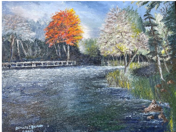
3: That Autumn Tree 16" X 20" Naturescape Oil on Canvas © Dennis Lee Brown 5/2022 - Dennis's Fine Art (ARR) The Open Air Collection: IMG-2312-795USD

Artists use a variety of techniques, principles, and methods to create their drawings and paintings. From the use of color and light to the application of different mediums such as paint, charcoal, graphite, pastels, ink, and other mediums affixed to prepared supports. Many artists also use composition, perspective, and form to create their pieces. Understanding the fundamentals of color theory and the principles of design can help an artist create