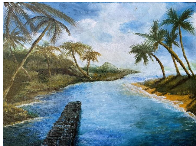
2: Hawaii Plush

Methods are the steps taken by an artist to create a work, such as planning the composition, sketching, selecting materials, and executing the artwork. To gain a better understanding of these terms, reading up on the different techniques, principles, and methods used by famous artists is a great way to gain insight and inspiration.