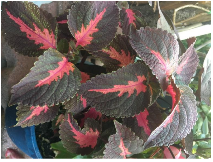
Blossoms: 22 COLEUS Sunset Boulevard

WEB: How to grow & care for COLEUS –, with creative display ideas and green thumb growing tips. Learn all about watering, light exposure, soil type, fertilizing, pruning, repotting, propagation methods, what you like and what works for you.