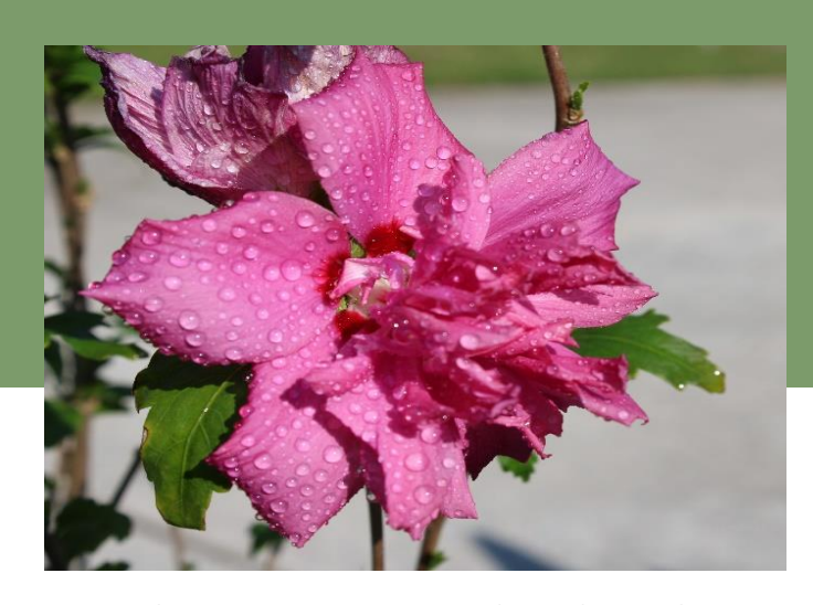
Blossoms: 9 ROSE OF SHARON Close and Personal

Plants either outdoors or in, add desirable attraction to any space whether the garden, porch, or deck. In the corridor, vestibule, or any room, plants, and flowers enhance our public and private domain. Not only do they add luster to our habitations, but some clean our air as well, providing us with healthier breathing. These are some of the plants that I have, and I would like to share my understanding of how I grow and take care of them.