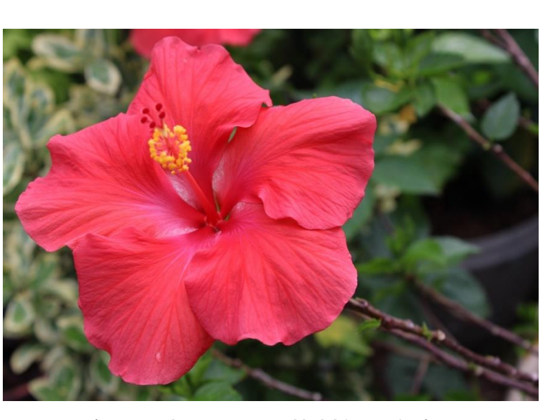
Blossoms: 13 HAWAIIAN HIBISCUS Crimson Big Bloom