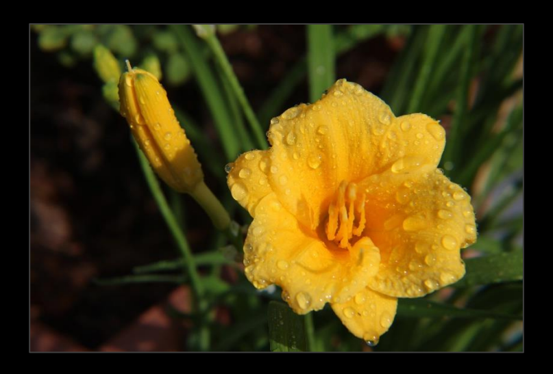
Blossoms: 10 YELLOW DAYLILY Affectionate Showers