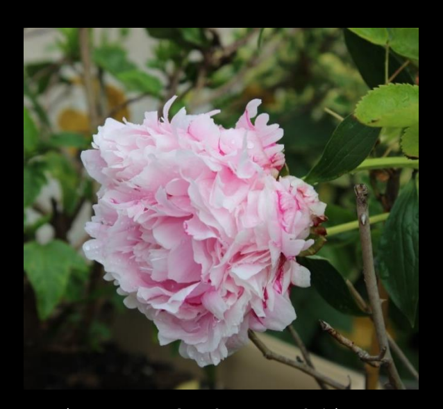
Blossoms: 5 PAEONIA SU. ANDREWS Pink Tree Peony