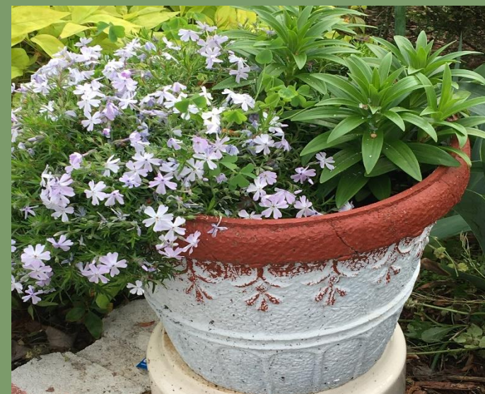
Blossoms: 20 CONTAINER OF ASSORTED PERENNIALS

trying to achieve. You can pot all of the plants in the same container--which is a more long-lasting solution--or you can fit individual pots into a bigger pot or