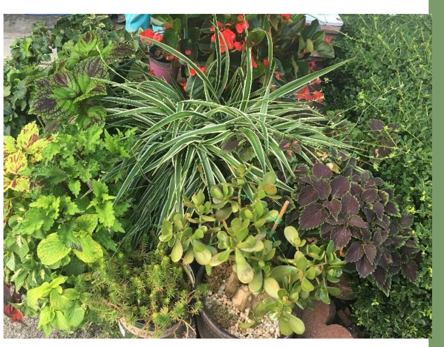
Blossoms: 19 GROUPED GROUND PLANTS

Besides being eye-catching, mixed plantings are also low maintenance. Plants that would otherwise grow large on their own markedly slow down their growth in a group-growing situation, staying compact. They can also be planted in pots or planter boxes, depending on the look you're