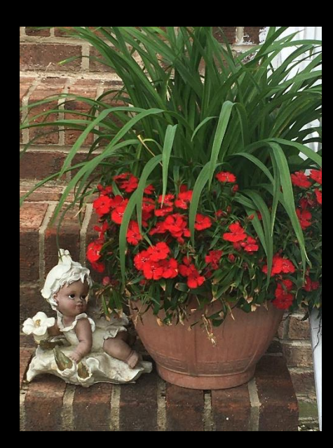
Blossoms: 17 ARRANGEMENT & GUARDIAN ANGEL

Houseplants are amazingly adaptable to many indoor areas. They can thrive together in a mixed planting for years. Such miniature gardens are attractive and give you the opportunity to mix and match a number of your favorite plants all in the same container. While all houseplants brighten up the interior, mixed plantings are real decorator items.