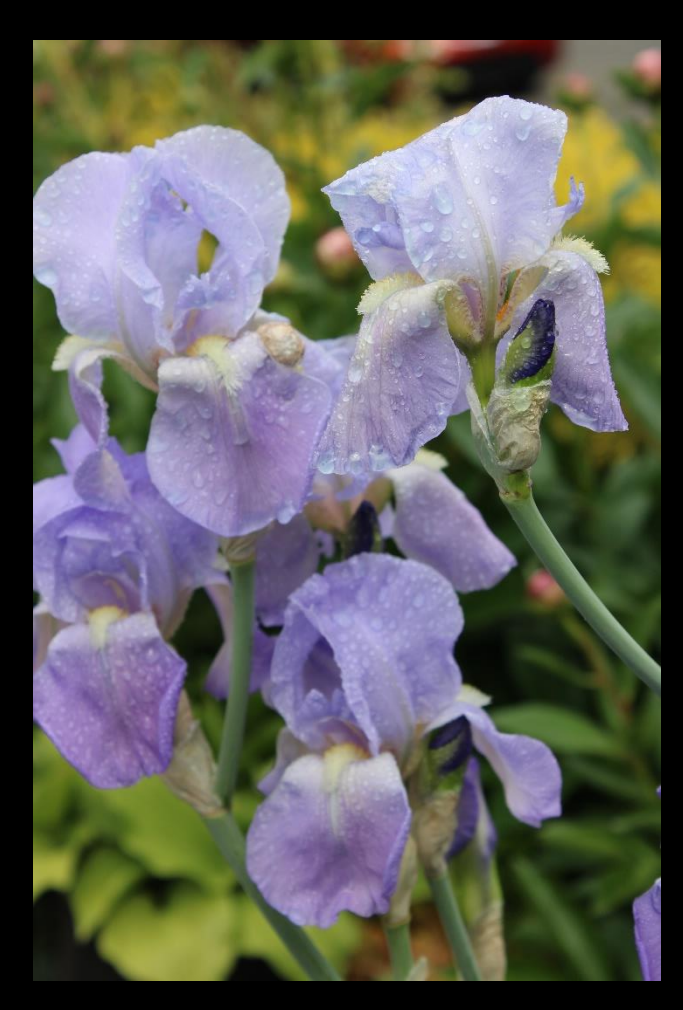
Blossoms: 3 BREADED SWEET IRIS Basking in Cool Rain