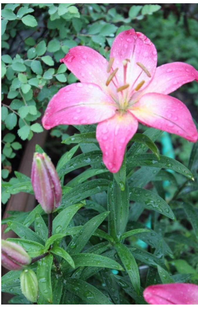
Blossoms: 2 LILIUM BULBIFERUM L Gaping Wide-open