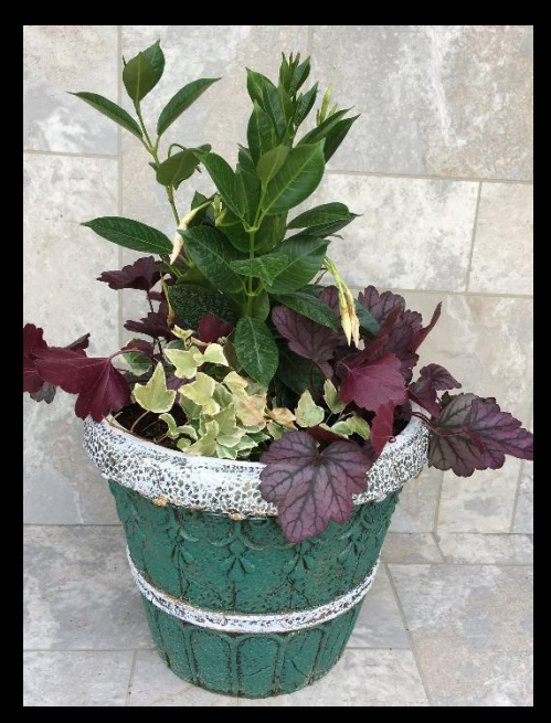
Blossoms: 18 MIXED CONTAINER ASSORTED PLANTS

Houseplants are amazingly adaptable to many indoor areas. They can thrive together in a mixed planting for years. Such miniature gardens are attractive and give you the opportunity to mix and match a number of your favorite plants all in the same container. While all houseplants brighten up the interior, mixed plantings are real decorator items.