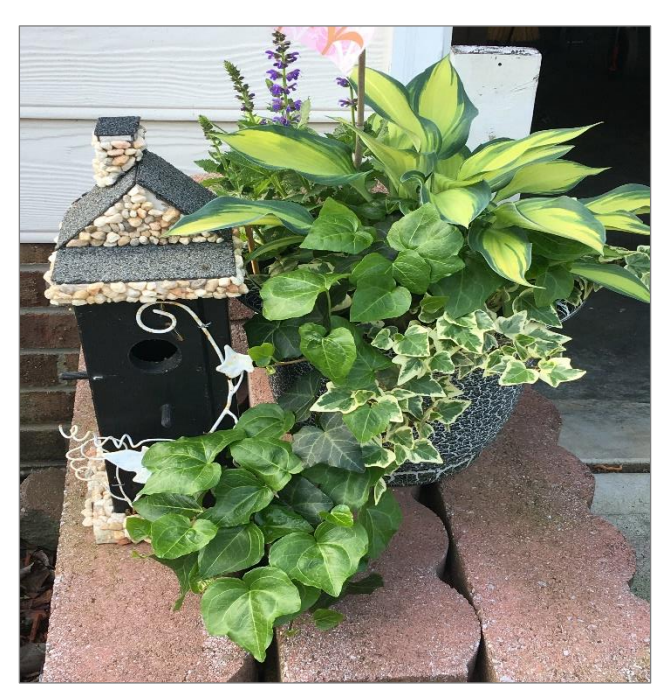
Blossoms: 16 PLANTS ARRANGEMENT & BIRDHOUSE