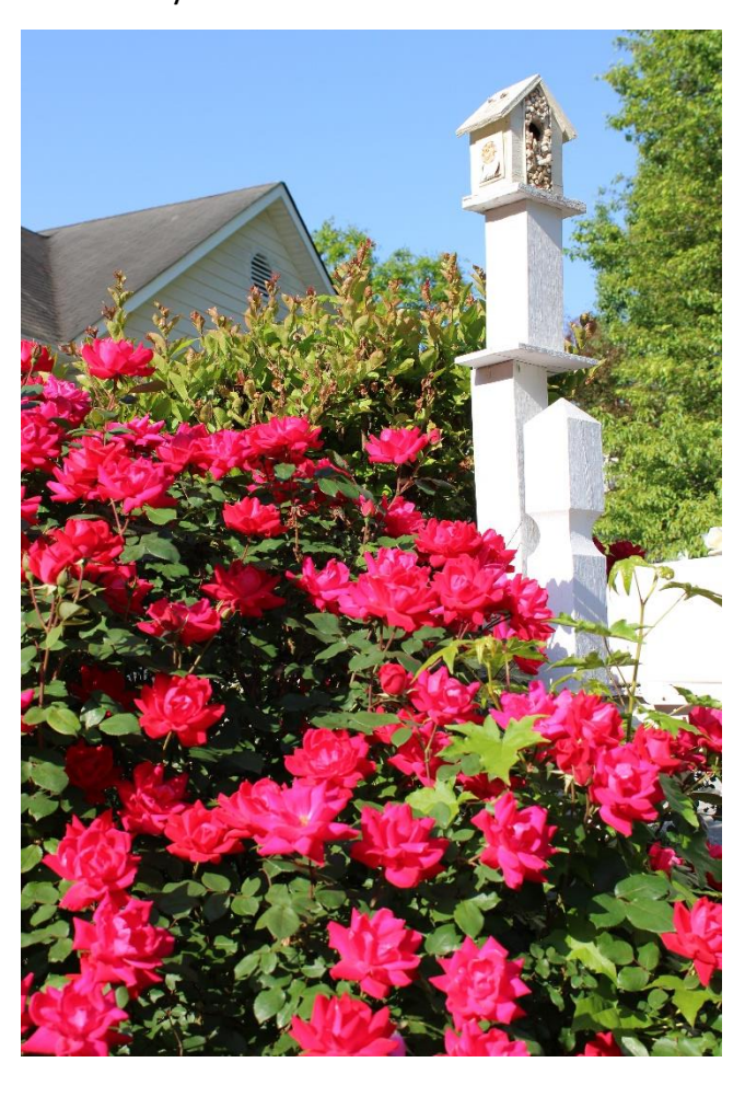
Blossoms: 8 WHITE BIRDHOUSE & RED KNOCKOUTS

gathering plant care data, and now I am passing this on to you.