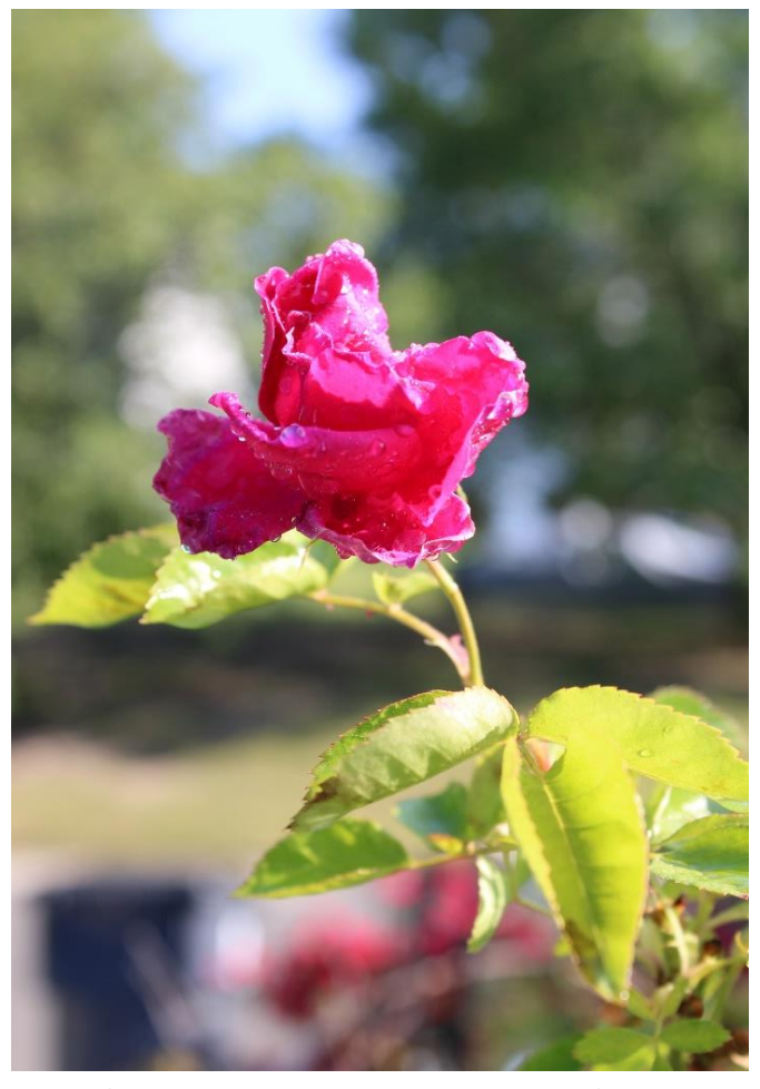
Blossoms: 15 ROSA PENDULINE Mountain Red Rose