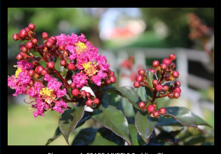
Blossoms: 4 CRAPE-MYRTLE Budding Glory