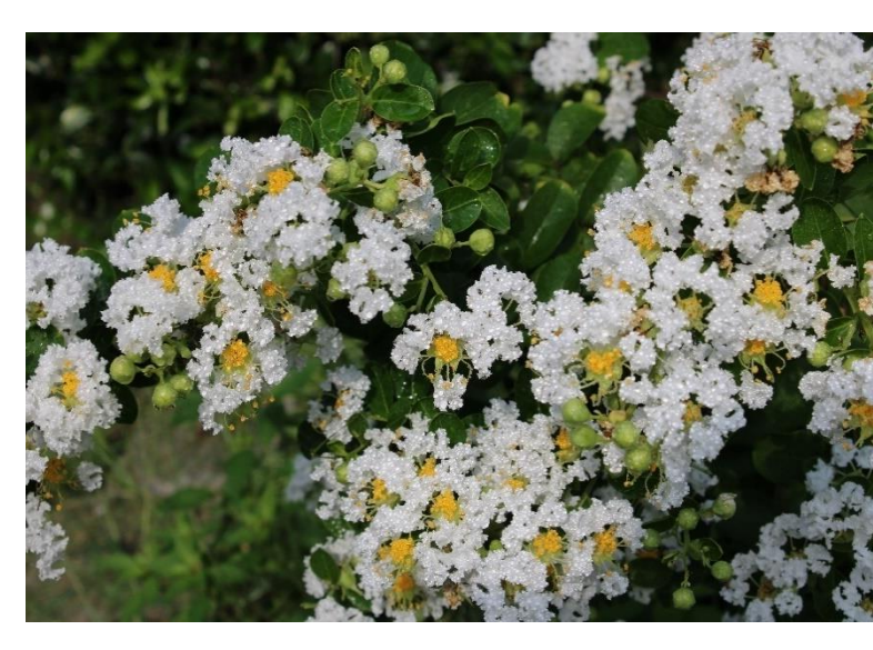
Blossoms: 12 CRAPE-MYRTLE Pearls of White