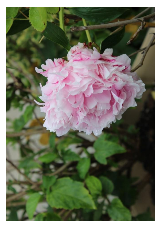
Blossoms: 14 PAEONIA SUFF. ANDREWS Pink Tree Peon