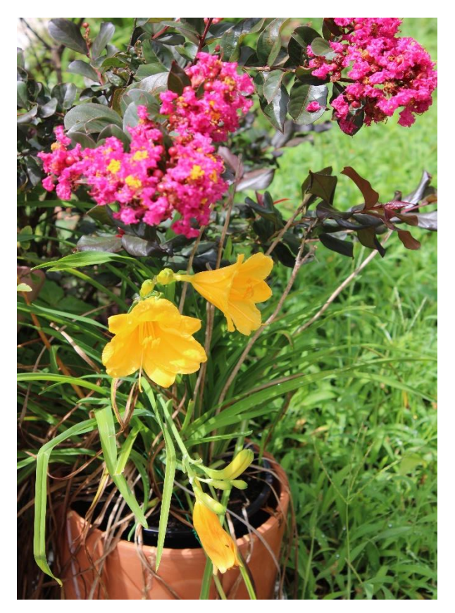
Blossoms: 6 CRAPE-MYRTLE & DAY LILY Fellowshipping

I have enjoyed growing plants for over 50 years and still counting. All things about nature and seasons, the warm sunshine, the sound of the raindrops, the frigid cold, and the dancing snowflakes enhance my spirit and mind as I enjoy God's creation of nature.