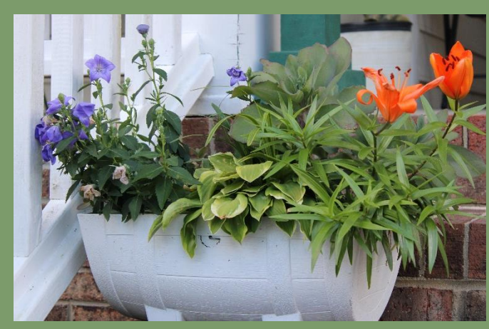
Blossoms: 21 PACKED PLANTER OF PERENNIAL

basket and cover with moss. The latter approach will mean tending to each pot and replacing the plants as they outgrow their containers. If you choose your plants carefully, it's possible to plant all in the same pot and have those plants thrive together.