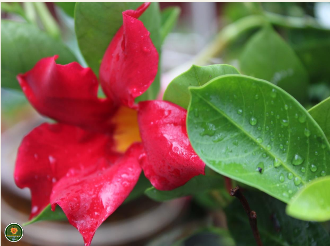
DEW-DRIPPED RED BRAZILIAN-JASMINE © Dennis's Plant Garden - Botanical Photo IMG-0254

Dennis's Plant Garden - Botanical Gallery.pdf