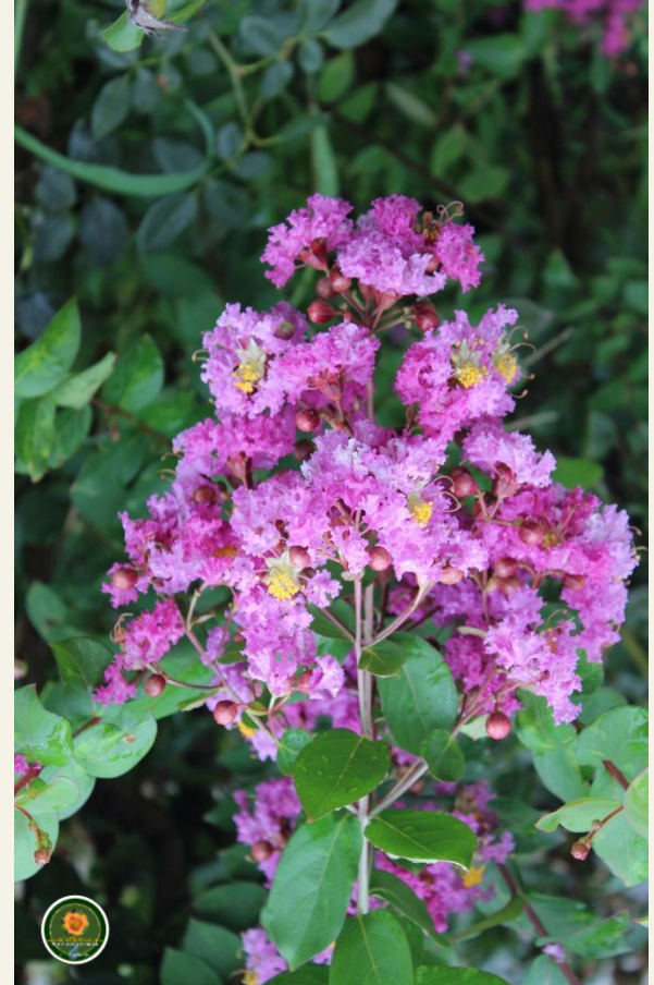
DRAPED LILAC CRAPE MYRTLE © Dennis's Plant Garden Botanical Photo IMG-0269