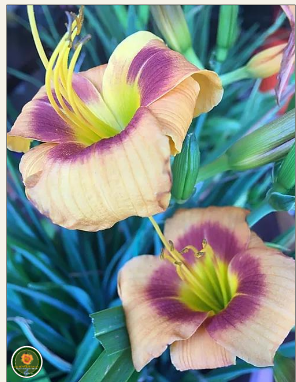
OPEN DAYLILIES Dennis's Plant Garden Botanical IMG 1983