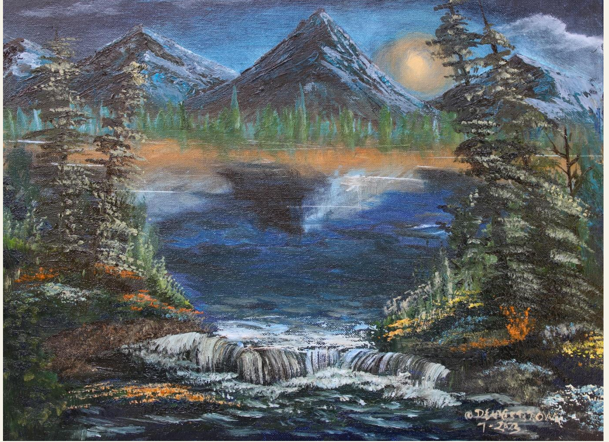
NIGHTFALL AT LAKE MOUNTAIN Naturescape 12h X 16w Oil on Canvas Dennis's Fine Art ARR Collection: The Warm Season of 2023 IMG0154-695USD