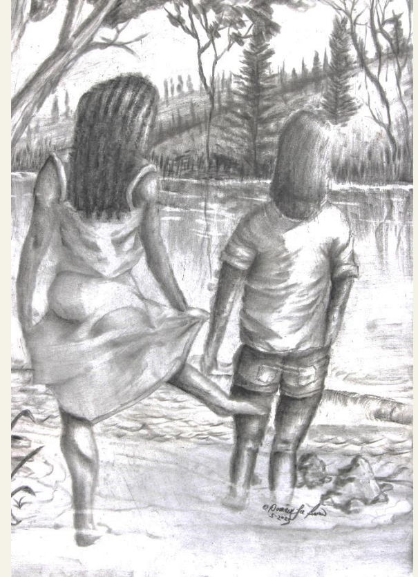
WE ARE WALKING IN THE WATER Naturescape 17" h X 14" w Charcoal & Graphite on Bristol, © Dennis Lee Brown 6/2023 Dennis's Fine Art, Collection: The Warm Season of 2023 IMG0141-395USD

In art theory and color concept, White is an achromatic color, literally a "color without hue", that is a mixture of the frequencies of all the colors of the visible spectrum. The stimulation of all three types of color-sensitive cone cells in the eye results in white when incoming light is in equal amounts. In many respects, white is a synonym for light. Light is a blending of all colors and therefore, a color, but appears colorless [white]. While Black, is being without any degree of light/white – in other words, black is the total absorption of light. Therefore, white, and black are adding and/or subtracting of color in equal portions.