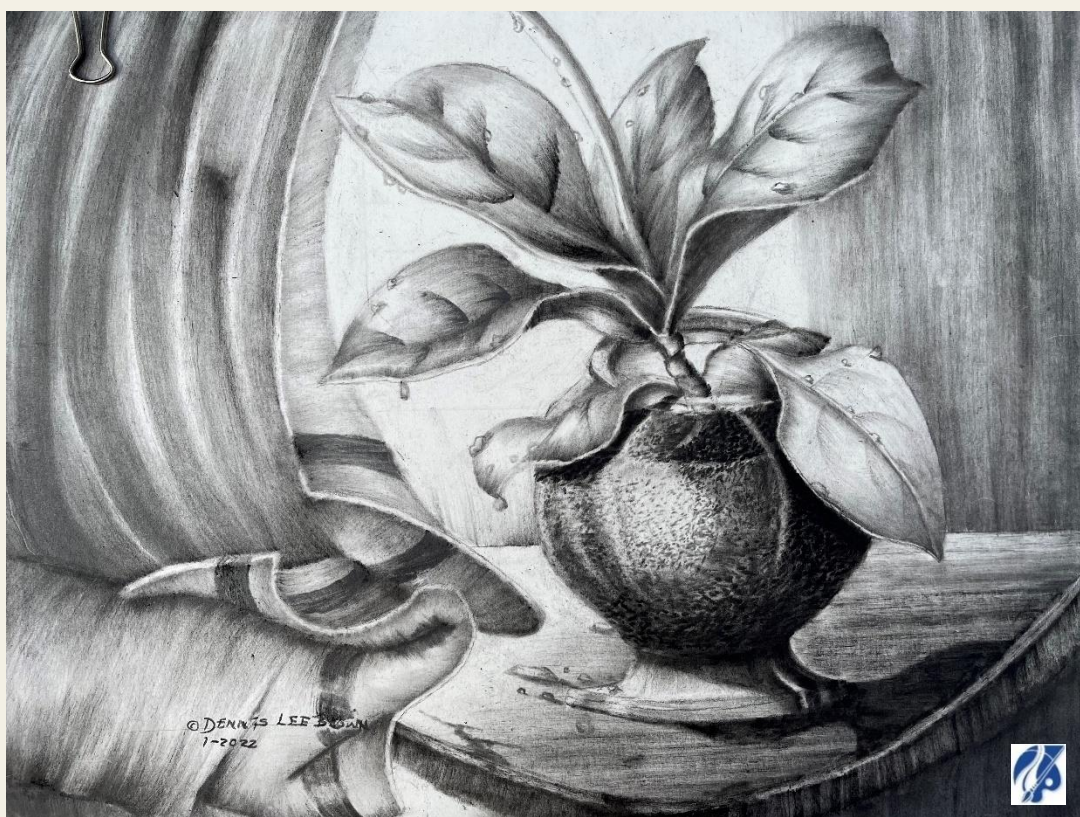
AN OVERGROWN POT 17w X 14h Still life Charcoal & Graphite on Paper 11-2022 Dennis Fine Art (ARR) IMG-3516-495USD Winter 2022 Drawings