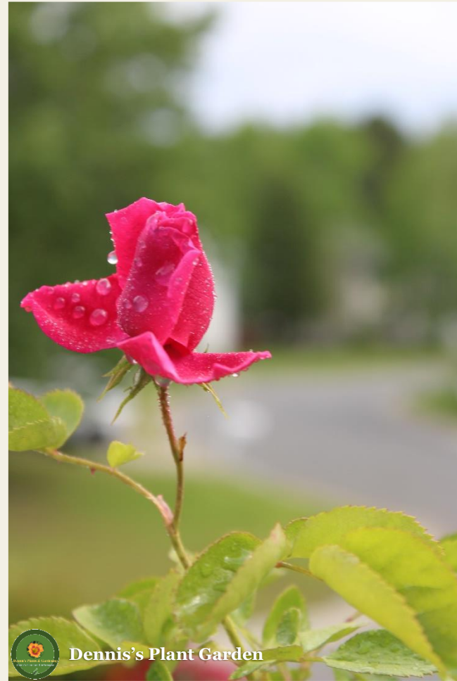
TEARDROPS OF A SWEETHEART ROSE Dennis Plant Garden IMG-0480

DENNIS PLANT GARDEN Plant Care & Information