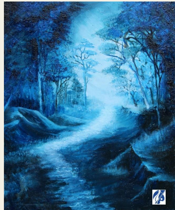
DREAMS OF BLUE Nature Scape Abstract 16X20 Oil on Canvas © Dennis Lee Brown 6-2024 Dennis Fine Art The Warm Retouch Collection IMG-0535-395USD

painting. When light contacts the layers of pigmented hues it reflects off the first dense layer it strikes. Then it goes back and forth through consecutive translucent layers of color. This means that the color(s) on the canvas is on purpose mixed optically rather than physically. This means that the layers of oil paint remain applied in a way that the viewer can see them. Due to the multiple layers of hardened (dried) oil, the appearance of the painting has remarkable intensity and intensity of color that a painter could not achieve by mixing the hues on a palette and applying it in one dense thick, slightly intertwined layer. The brilliance (light) achieved by painting with the glazing technique is what draws artists to paint with this method. This practice is a sure way to add more depth to the subject matter within the art. Although this process is time-consuming, it is well worth the extra hours spent perfecting this