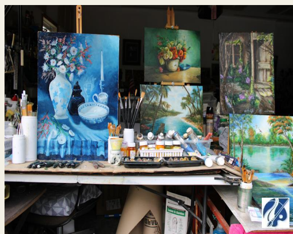
The Retouch Work Table