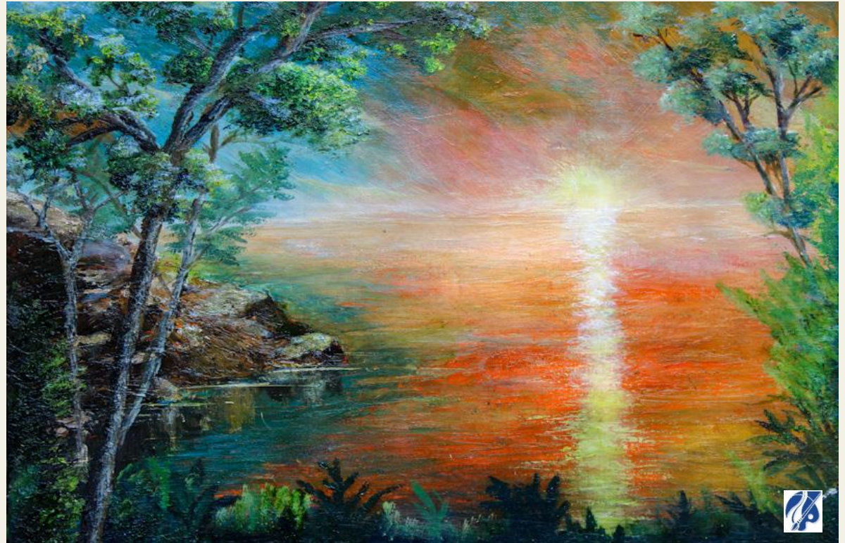
ORANGE SUNSET LAKE Nature Scape Abstract 16X20 Oil on Canvas ©Dennis Lee Brown 4-2024 Dennis Fine Art arr The Warm Retouch Collection IMG_0534-495USD

Glazing in oil painting is a revered technique that allows artists to achieve striking depth, color richness, and luminosity in their works. This method involves applying thin, transparent layers of oily paint (usually increased oiliness with each new coat) over a dry underpainting, which can profoundly alter the color and mood of a piece. The glaze, typically a mixture of a single pigment and a medium (generally, paint thinner/turpentine, mixed with linseed, walnut, or poppy-seed oil is spread thinly across the surface, allowing light to penetrate and reflect off the underlying layers, creating a glow that seems to emanate from within the painting itself. It is a technique that requires patience and precision, as each layer must be fully dry before the next application. Glazing can enhance the perception of distance