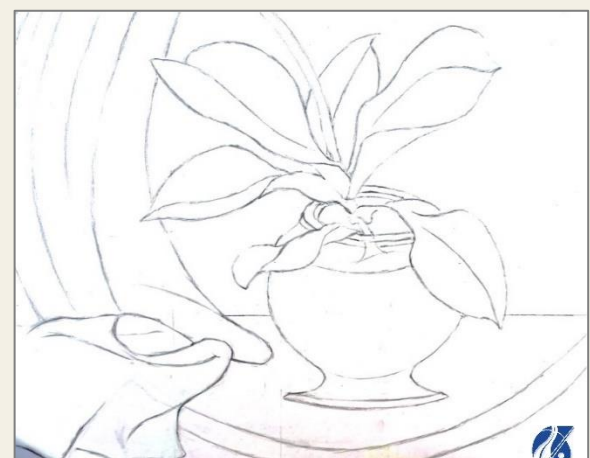
Draw This Series: An Overgrown Pot

Learn the correct methods the masters used to create their masterpieces