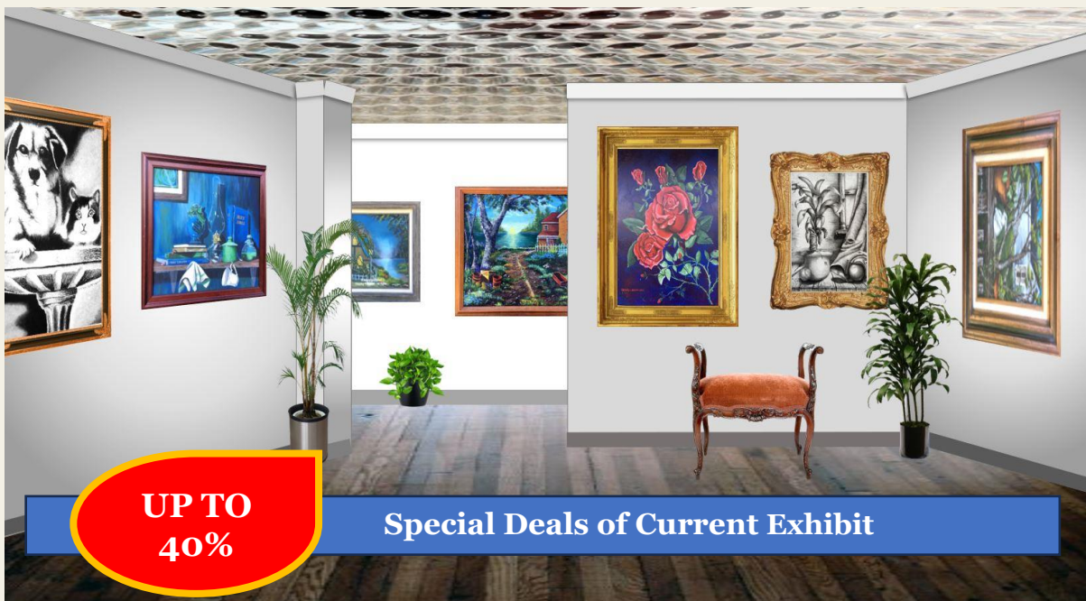
DENNIS'S FINE ART – Gallery Shop