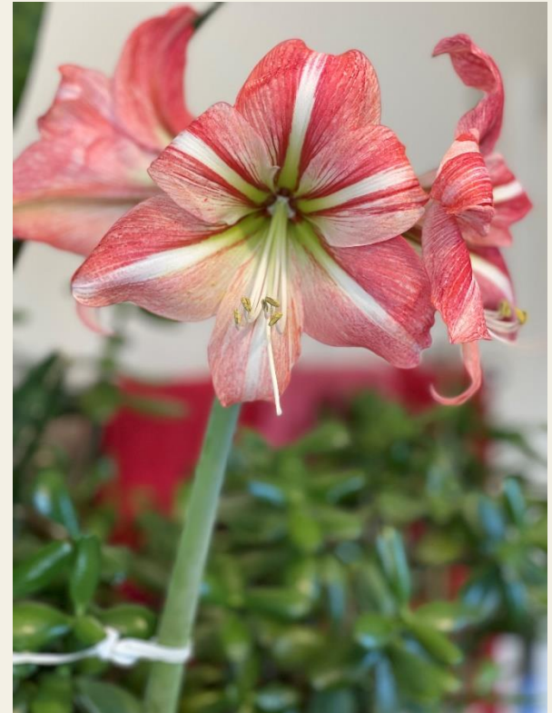
Hypogastrium vittate (Lahr.) Herb. IMGE1429

unique insight into what nature has to offer. Our gallery also offers free downloads of the photos so you can use them as wallpaper on any device. Explore our gallery today and bring the beauty of nature to your home! Not only can you browse the gallery for houseplant and/or gardening inspiration, and green thumb-growing tips, but you can also download Dennis's stunning botanical photographs for free and use them as wallpaper backgrounds for any device. It is a fantastic way to bring a bit of nature into your private surroundings. So, if you are looking for a little bit of nature's beauty to add to your device, home recreation, or work, area, explore and discover my galleries.