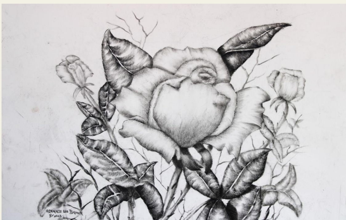
A ROSE OF LOVE

Still-Composition 17”7w X 14”h Charcoal & Graphite on Archival Bristle © Dennis Lee Brown 5/2023 Dennis's Fine Art, ARR Collection: The Warm Season of 2023 IMG-CGDEe0277-695USD