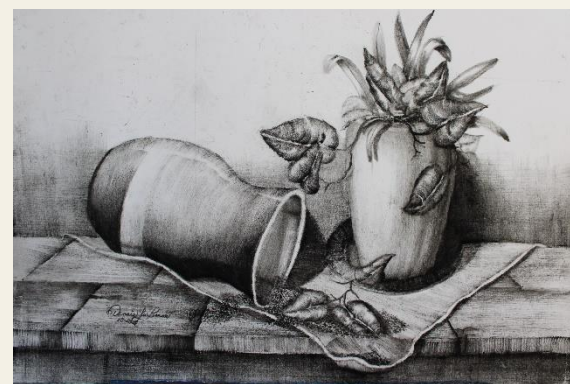
A FALLEN PLANTER Still-Life Composition 17" w X 14" h Charcoal & Graphite on Bristle © Dennis Lee Brown 5/2023 Dennis's Fine Art (All Rights Reserved) , Collection The Warm Season of 2023 CGD: IMG0294-495USD