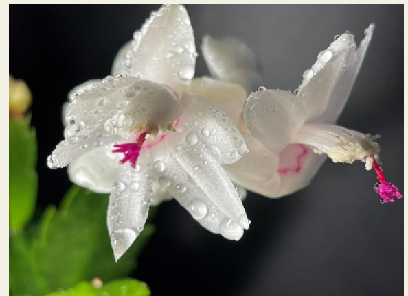
Dew Dropped Christmas Catus Blossoms