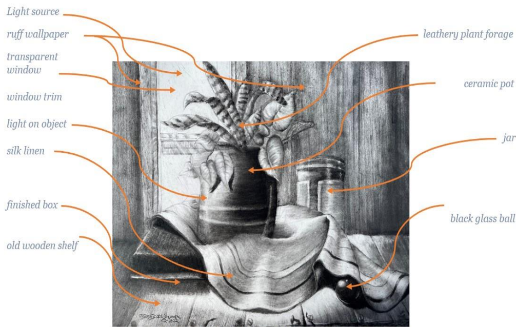
Figure 2: POTTED PLANT & LINEN 17" w X 14" h Stilllife Charcoal & Graphite on Paper (C) Dennis Lee Brown 11-2022 Dennis Fine Art (ARR) IMG-3513-495USD Winter 2022 Drawings