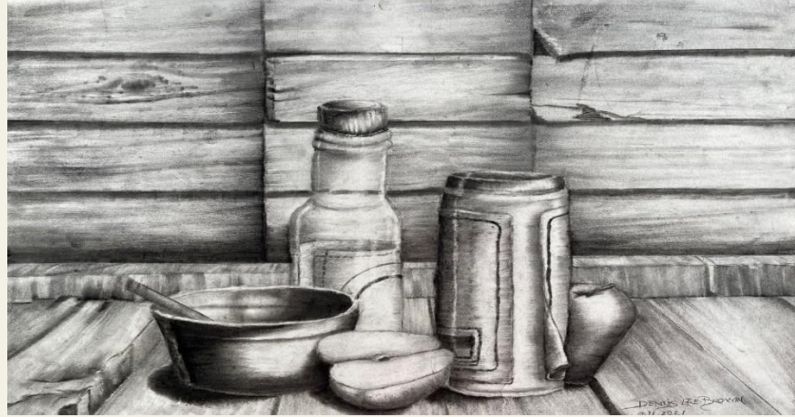
A CAN WITH APPELS Still-life Composition 17" w X 14"h Charcoal & Graphite on Archival Bristol © Dennis Lee Brown 12/2021 Dennis's Fine Art (ARR) IMG: E1289