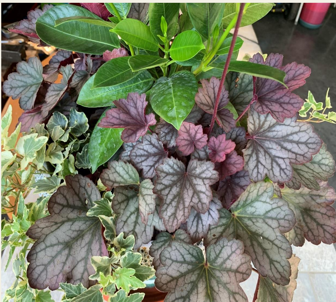
Botanical Leaf Bundle Group