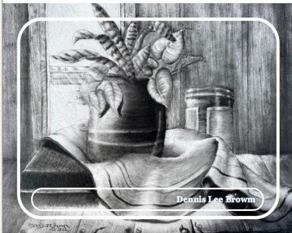
POTTED PLANT & LINEN 17" w X 14" h Stilllife Charcoal & Graphite on Paper (C) Dennis Lee Brown 11-2022 Dennis Fine Art (ARR) POTTEDIMG-3513-495USD Winter 2022 Drawings

Every object has a surface, and surfaces have a texture that forms in their production. Whether it is the extra smooth finished exterior of glass or the ridged roughness of concrete, everything's outward face has texture.