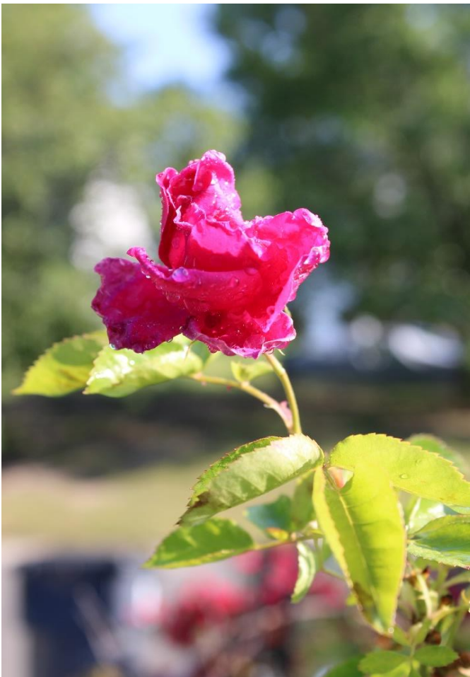
Blossoms: 15 ROSA PENDULINE Mountain Red Rose