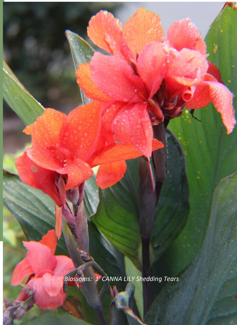
Blossoms: 1 CANNA LILY Shedding Tears

botanical photographs for free and use them as wallpaper backgrounds for any device. It is a fantastic way to bring a bit of nature into your private surroundings. So, if you are looking for a little bit of nature's beauty to add to your device, home recreation, or work, area, explore and discover my galleries.