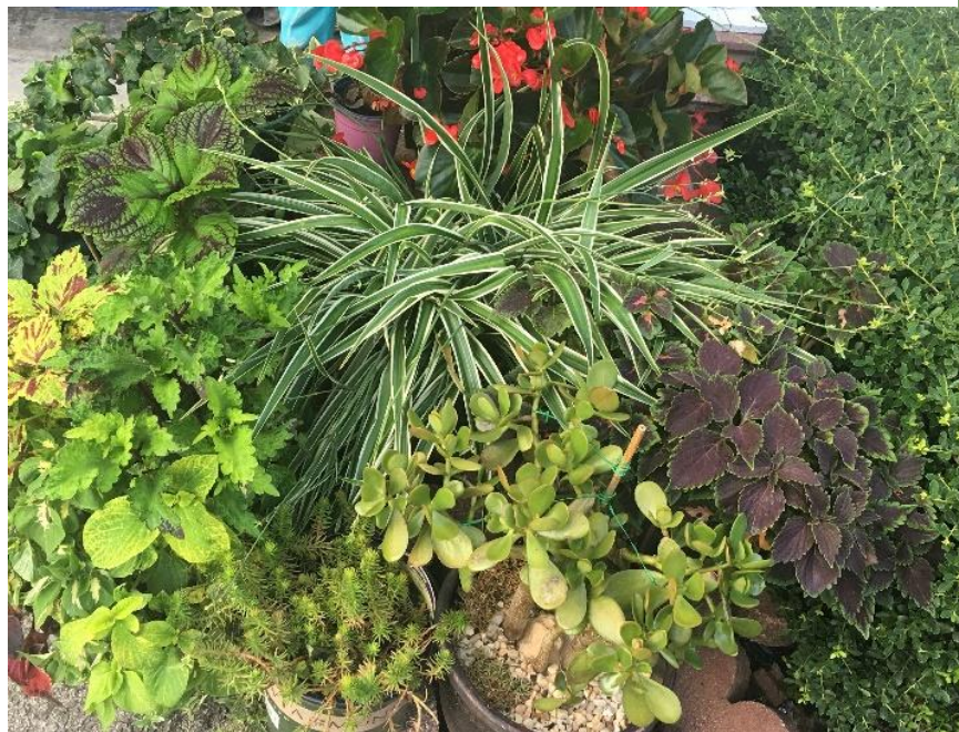
Blossoms: 19 GROUPED GROUND PLANTS

basket and cover with moss. The latter approach will mean tending to each pot and replacing the plants as they outgrow their containers. If you choose your plants carefully, it's possible to plant all in the same pot and have those plants thrive together.