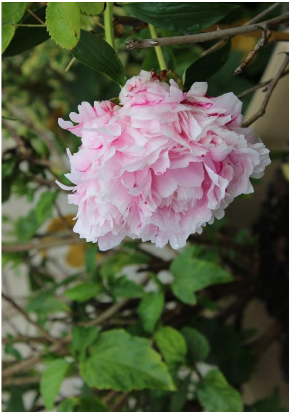
Blossoms: 14 PAEONIA SUFF. ANDREWS Pink Tree Peon