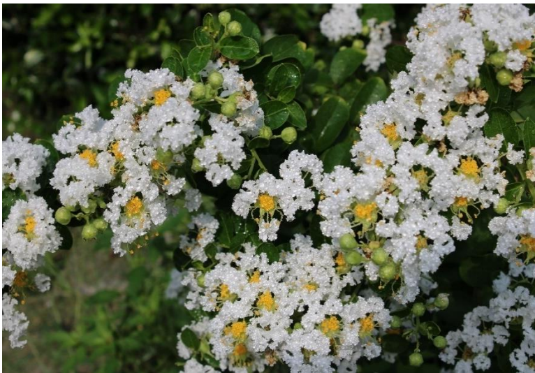
Blossoms: 12 CRAPE-MYRTLE Pearls of White