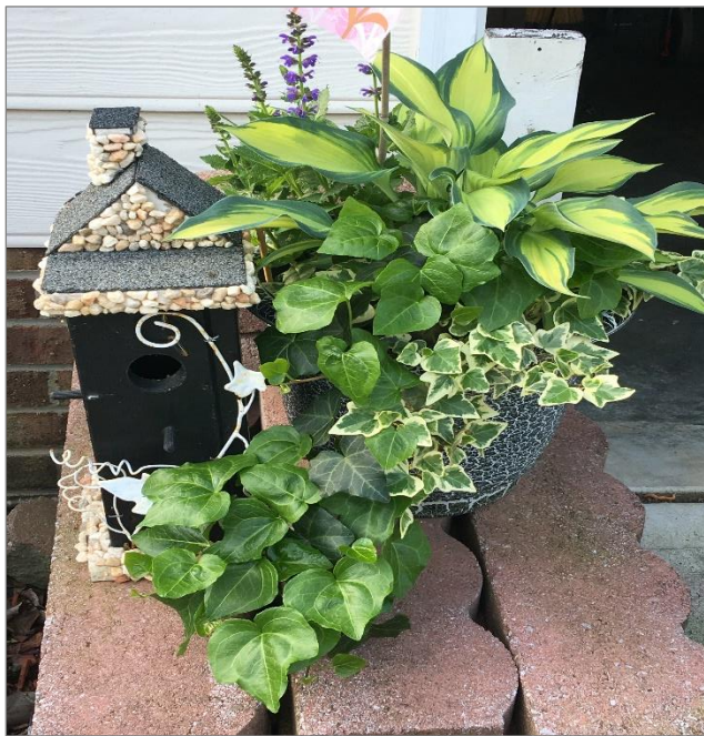
Blossoms: 16 PLANTS ARRANGEMENT & BIRDHOUSE