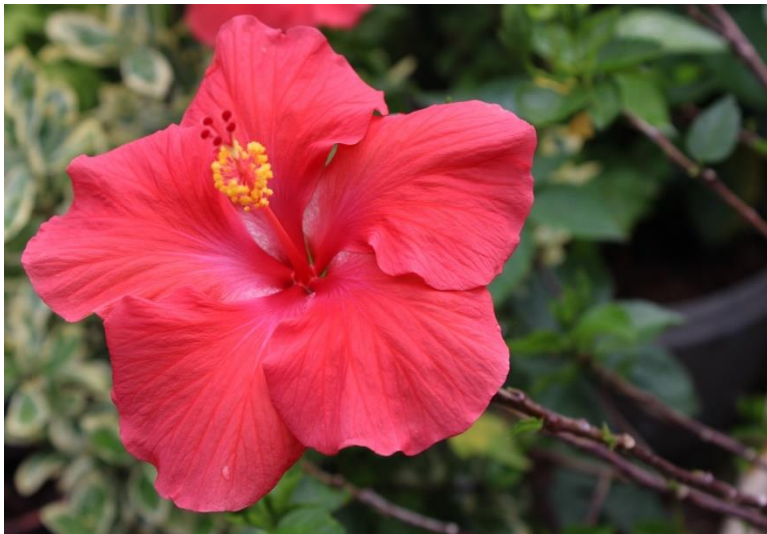
Blossoms: 13 HAWAIIAN HIBISCUS Crimson Big Bloom