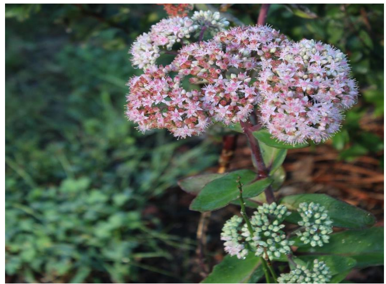
Blossoms: 23 ERECT STONECROP Close Up