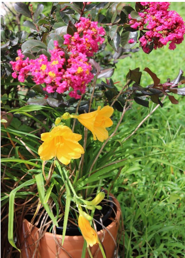
Blossoms: 6 CRAPE-MYRTLE & DAY LILY Fellowship

I have enjoyed growing plants for over 50 years and still counting. All things about nature and seasons, the warm sunshine, the sound of the raindrops, the frigid cold, and the dancing snowflakes enhance my spirit and mind as I enjoy God's creation of nature.