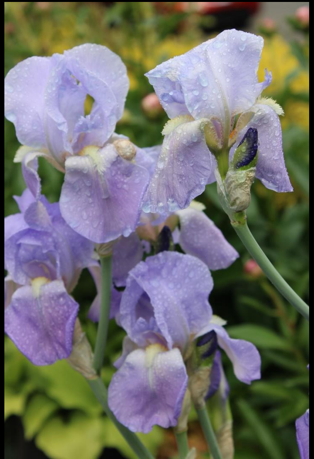
Blossoms: 3 BREADED SWEET IRIS Basking in Cool Rain