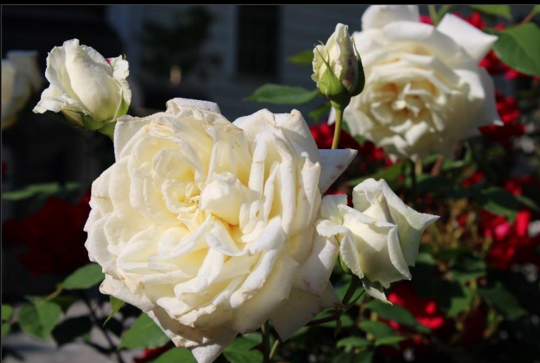
Blossoms: 7 WICHURA'S ROSE White Rose Blossom & Buds