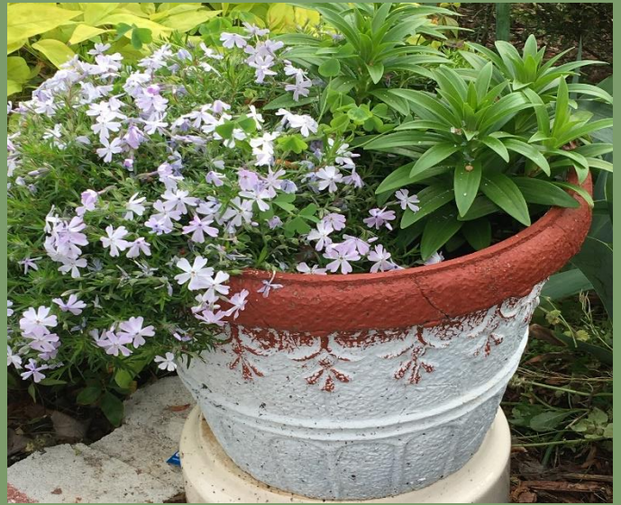
Blossoms: 20 CONTAINER OF ASSORTED PERENNIALS

Besides being eye-catching, mixed plantings are also low maintenance. Plants that would otherwise grow large on their own markedly slow down their growth in a group-growing situation, staying compact. They can also be planted in pots or planter boxes, depending on the look you're