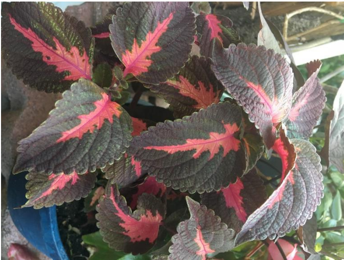
Blossoms: 22 COLEUS Sunset Boulevard

WEB: How to grow & care for COLEUS –, with creative display ideas and green thumb growing tips. Learn all about watering, light exposure, soil type, fertilizing, pruning, repotting, propagation methods, what you like and what works for you.