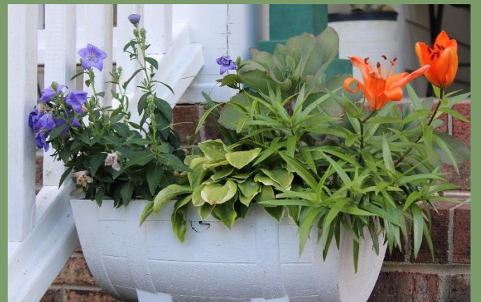
Blossoms: 21 PACKED PLANTER OF PERENNIAL

trying to achieve. You can pot all of the plants in the same container--which is a more long-lasting solution--or you can fit individual pots into a bigger pot or