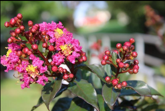
Blossoms: 4 CRAPE-MYRTLE Budding Glory