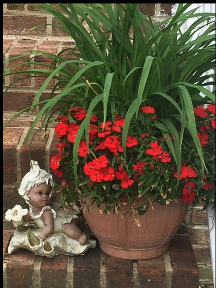
Blossoms: 17 ARRANGEMENT & GUARDIAN ANGEL

Houseplants are amazingly adaptable to many indoor areas. They can thrive together in a mixed planting for years. Such miniature gardens are attractive and give you the opportunity to mix and match a number of your favorite plants all in the same container. While all houseplants brighten up the interior, mixed plantings are real decorator items.