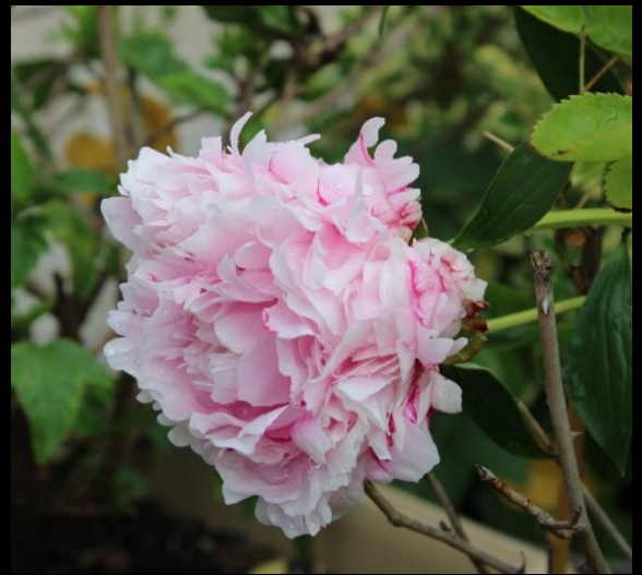
Blossoms: 5 PAEONIA SU. ANDREWS Pink Tree Peony