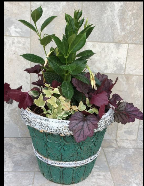
Blossoms: 18 MIXED CONTAINER ASSORTED PLANTS

Houseplants are amazingly adaptable to many indoor areas. They can thrive together in a mixed planting for years. Such miniature gardens are attractive and give you the opportunity to mix and match a number of your favorite plants all in the same container. While all houseplants brighten up the interior, mixed plantings are real decorator items.