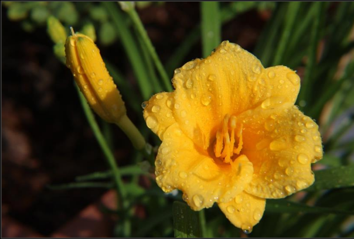
Blossoms: 10 YELLOW DAYLILY Affectionate Showers

sowing season, as Annuals lives to the blossoming of the flower, and the demise of the plant, which takes around the first frost of the cold season.