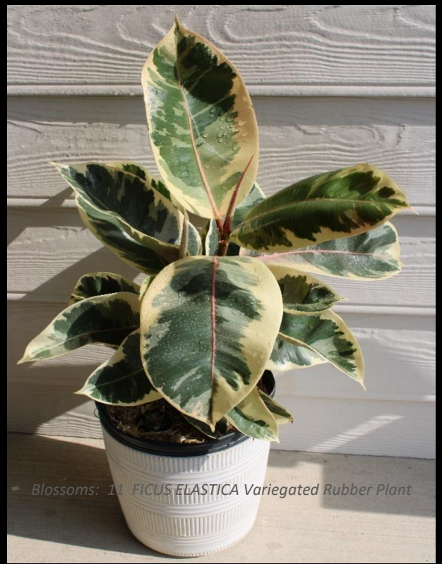
Blossoms: 11 FICUS ELASTICA Variegated Rubber Plant

Annuals - An annual plant completes its life cycle, from the germination of