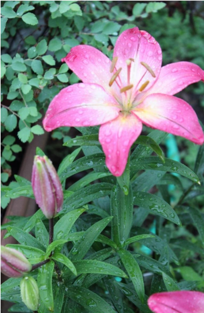
Blossoms: 2 LILIAM BULBIFERUM L Gaping Wide-open