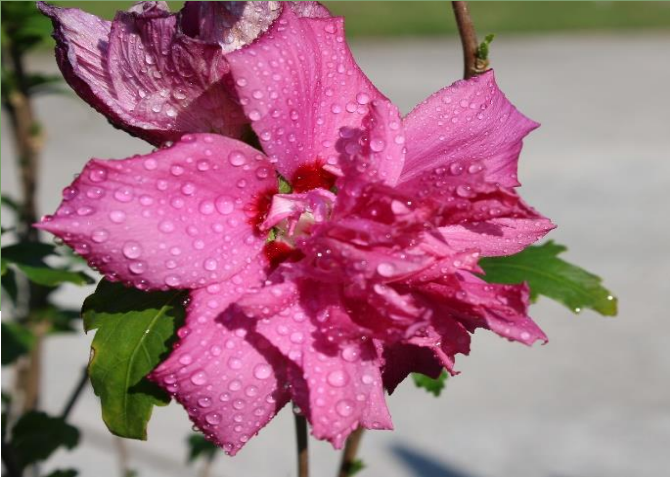
Blossoms: 9 ROSE OF SHARON Close and Personal

Plants either outdoors or in, add desirable attraction to any space whether the garden, porch, or deck. In the corridor, vestibule, or any room, plants, and flowers enhance our public and private domain. Not only do they add luster to our habitations, but some clean our air as well, providing us with healthier breathing. These are some of the plants that I have, and I would like to share my understanding of how I grow and take care of them.